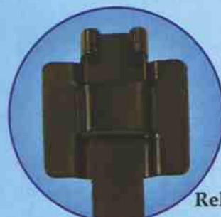
Releasable Coated Heavy Duty Ties