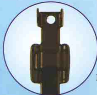
Releasable Coated Regular Ties